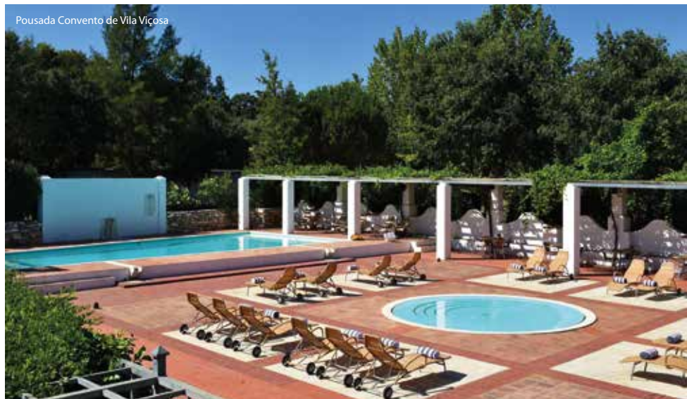
Pousada Convento de Vila Viçosa