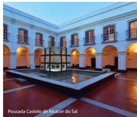
Pousada Castelo de Alcácer do Sal

Day Eight: After breakfast, drive to Lisbon airport for your return flight home.